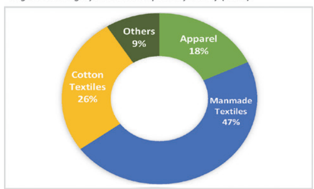
Figure 1: Category-wise T&A imports by Turkey (2017)

India was the second largest supplier of textile and apparel products to Turkey in 2017. India's exports of T&A to Turkey stood at $0.58 billion in 2017, whereas exports of textile and apparel products witnessed a decline of 9% over the last five years. India's share has also declined