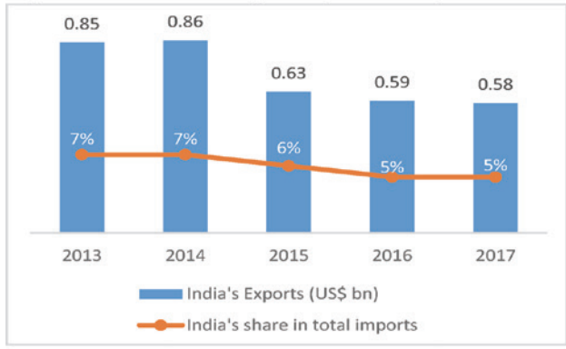
Figure 3: India's Textile and Apparel Exports to Turkey